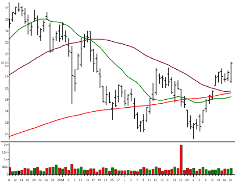
CNH GLOBAL N V SHS NEW

Daily (Standard) (Left) CNH - CNH GLOBAL N V SHS NEW Bar Volume MA20 MA50 MA200