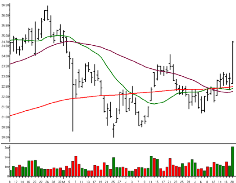
PACKAGING CORP AMER

Daily (Standard) (Left) PKG - PACKAGING CORP AMER Bar Volume MA20 MA50 MA200