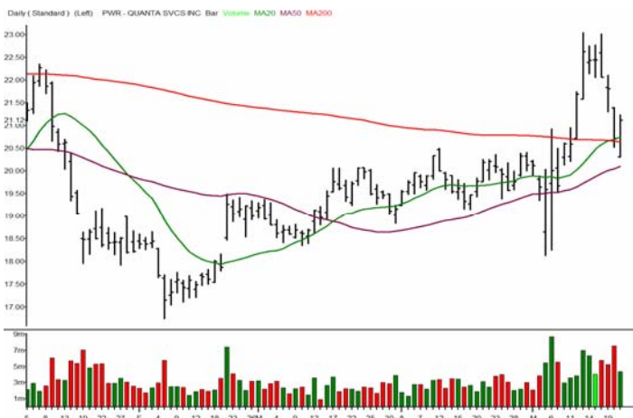
QUANTA SVCS INC