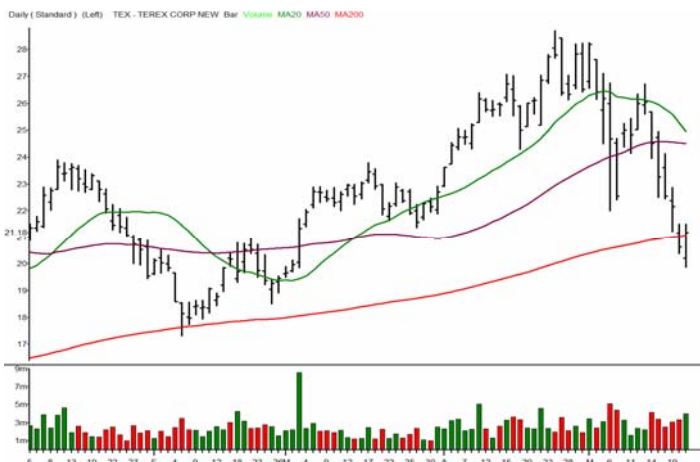
TEREX CORP NEW