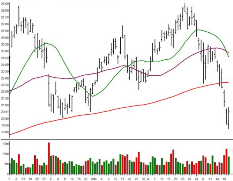
ARCH COAL INC

Daily (Standard) (Left) ACI - ARCH COAL INC Bar Volume MA20 MA50 MA200