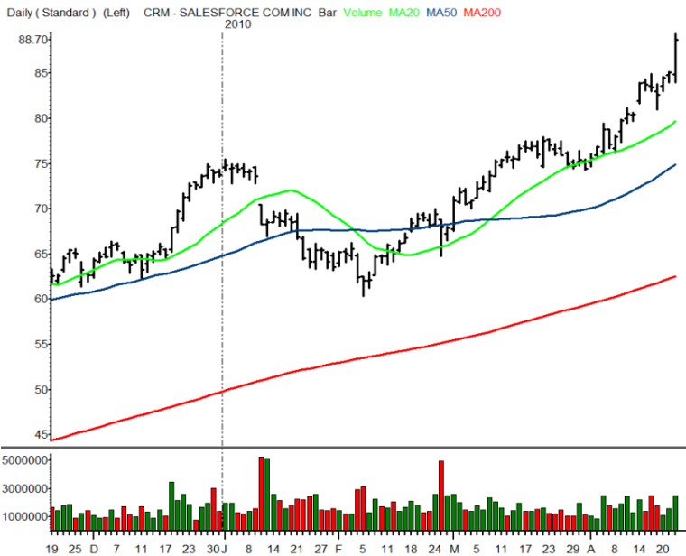
SALESFORCE COM INC

Symbol CRM Sector SOFTWARE Sector Symbol $XIT.X Pattern Fast Ball Position Long Entry 89.52 Target 89.9