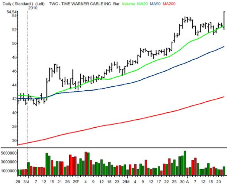
TIME WARNER CABLE INC

Symbol TWC Sector MEDIA Sector Symbol $IXY.X Pattern Fast Ball Position Long Entry 54.70 Target 55.05