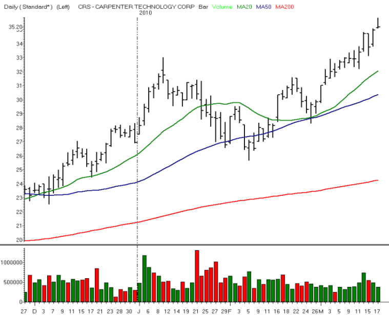
CARPENTER TECHNOLOGY CORP