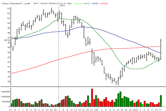
ROCK-TENN CO CL A