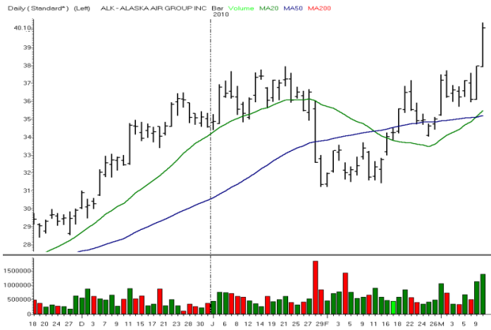
ALASKA AIR GROUP INC