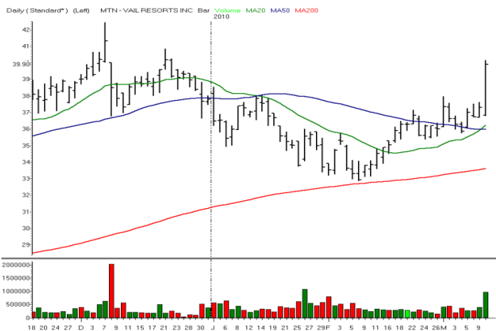
VAIL RESORTS INC