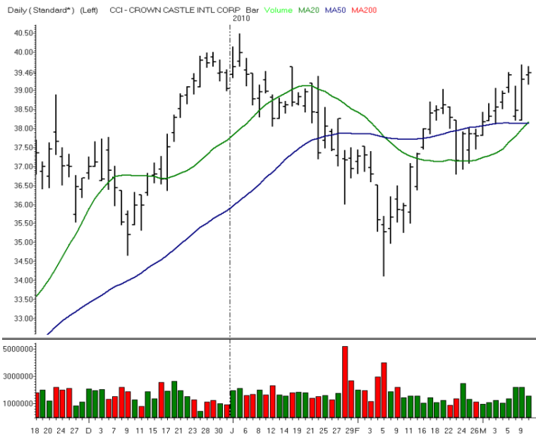
CROWN CASTLE INTL CORP