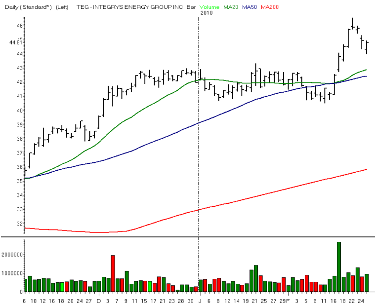
INTEGRYS ENERGY GROUP INC