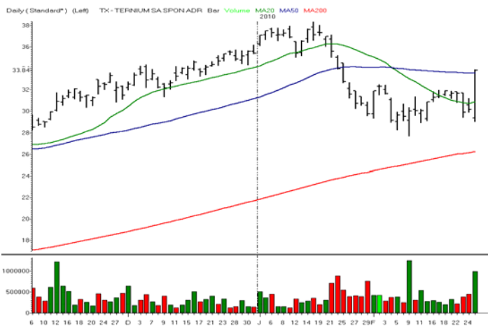
TERNIUM SA SPON ADR