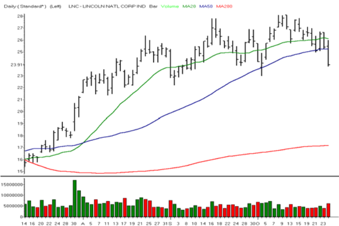
LINCOLN NATL CORP IND

Symbol LNC Pattern Fast Ball Position Short Entry 23.71 Stop ? Initial Target 23.15