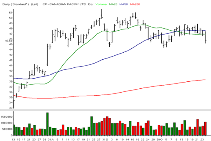
CANADIAN PAC RY LTD

CONSUMER DISCRETIONARY 50% To Target 29.99