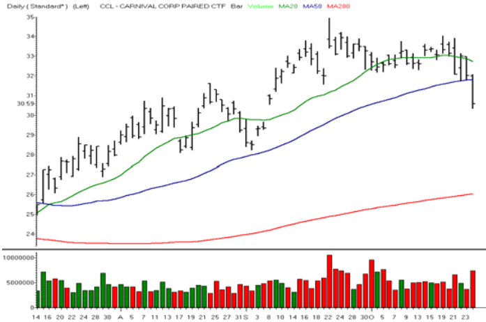
CARNIVAL CORP PAIRED CTF

Symbol CCL Pattern Fast Ball Position Short Entry 30.25 Stop ? Initial Target 29.73