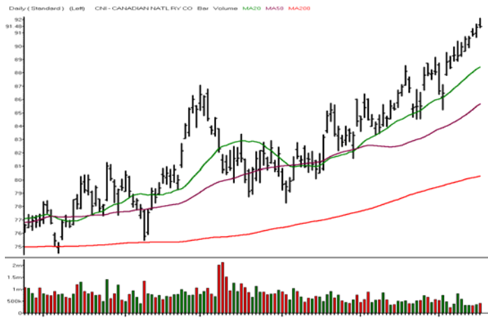
CANADIAN NATL RY CO