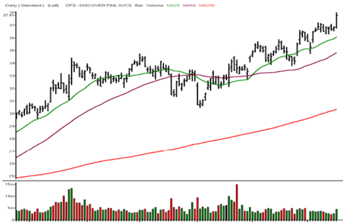
DISCOVER FINL SVCS