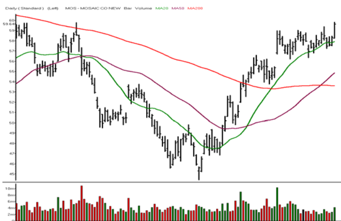
MOSAIC CO NEW