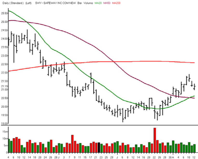
SAFEWAY INC COM NEW