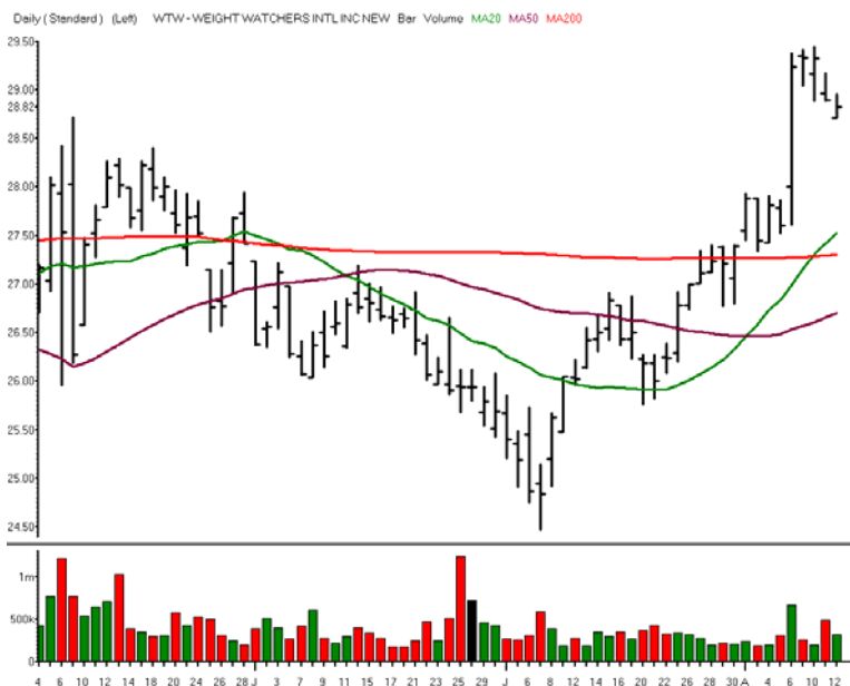
WEIGHT WATCHERS INTL INC NEW