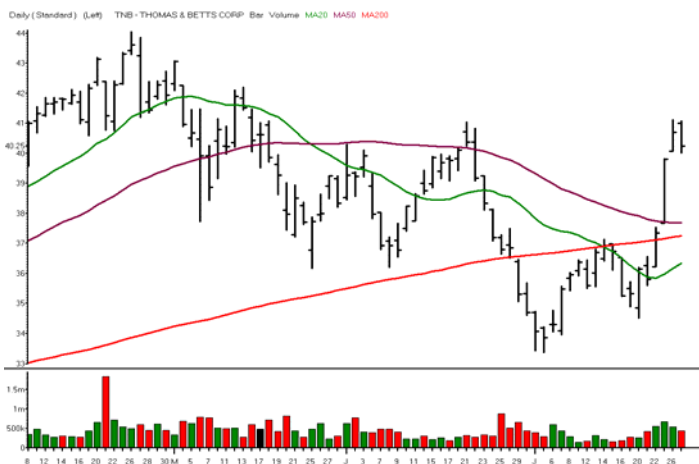
THOMAS & BETTS CORP