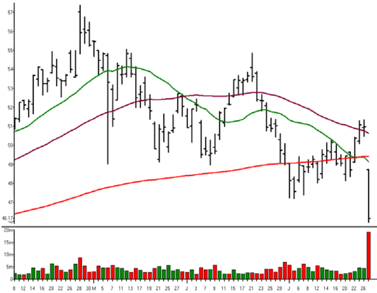
THERMO FISHER SCIENTIFIC INC

Daily (Standard) (Left) TMO - THERMO FISHER SCIENTIFIC INC Bar Volume MA20 MA50 MA200