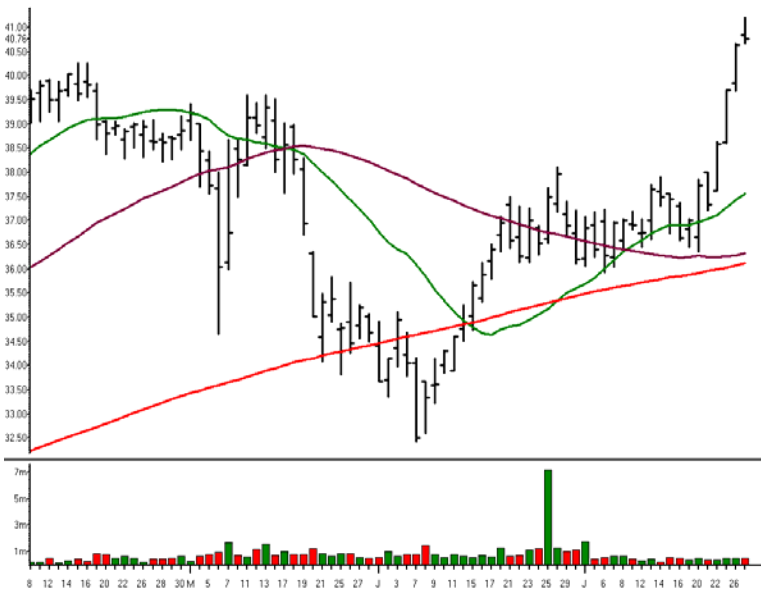
SOLERA HOLDINGS INC

Daily (Standard) (Left) SLH-SOLERA HOLDINGS INC Bar Volume MA20 MA50 MA200