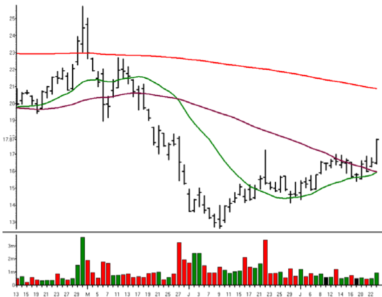
HORNBECK OFFSHORE SVCS INC NEW

Daily (Standard) (Left) HOS - HORNBECK OFFSHORE SVCS INC NEW Bar Volume MA20 MA50 MA200