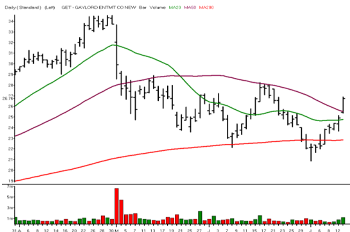
GAYLORD ENTMT CO NEW