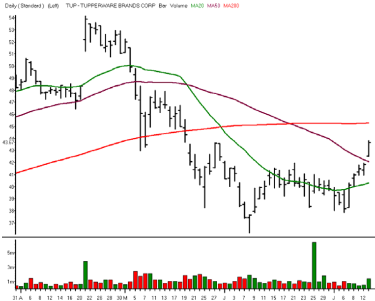
TUPPERWARE BRANDS CORP

Symbol TUP Sector HOUSEHOLD DURABLES Sector Symbol $IXY.X Pattern Line Drive Position Long Entry 43.95 Target 44.32