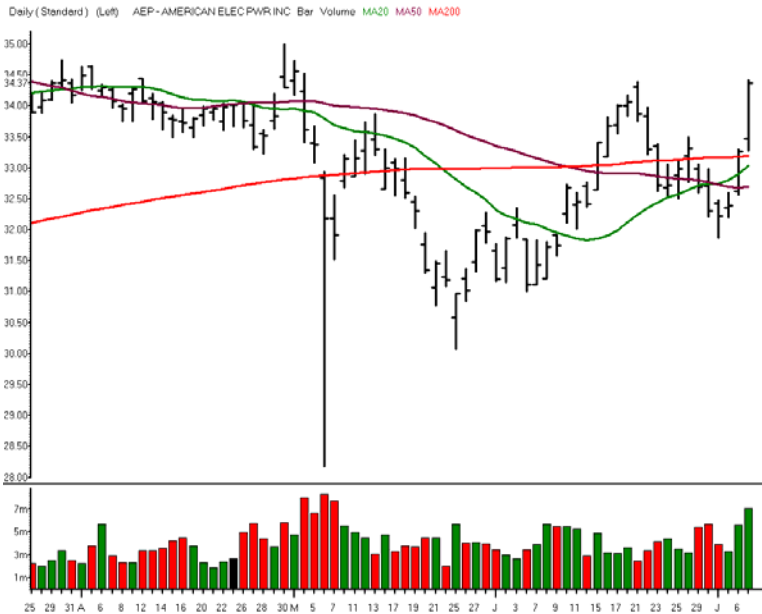
AMERICAN ELEC PWR INC

Symbol AEP Sector UTILITIES Sector Symbol $UTY.X Pattern Line Drive Position Long Entry 34.52 Target 34.81