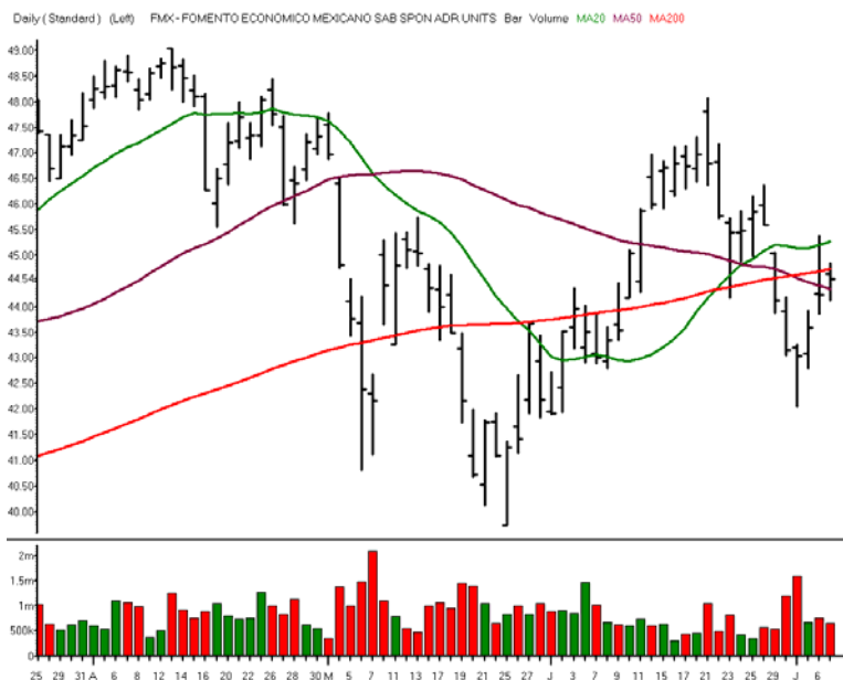
FOMENTO ECONOMICO MEXICANO SAB SPON ADR UI 50% To Target