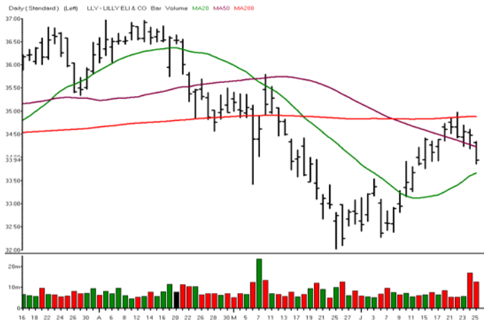
LILLY ELI & CO