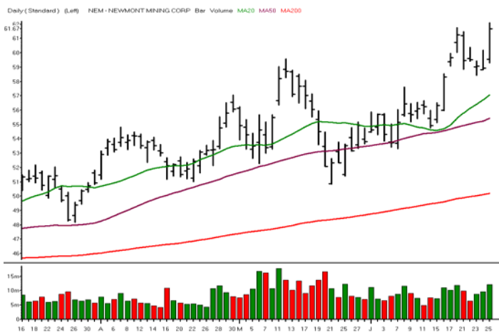
NEWMONT MINING CORP