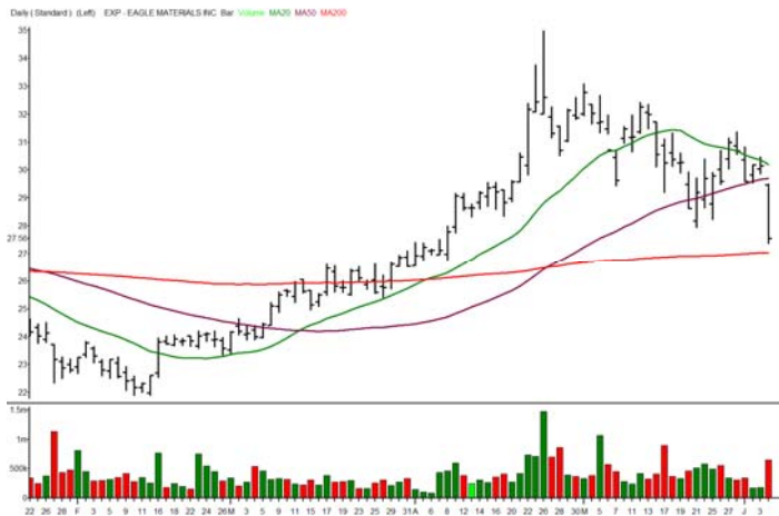
EAGLE MATERIALS INC