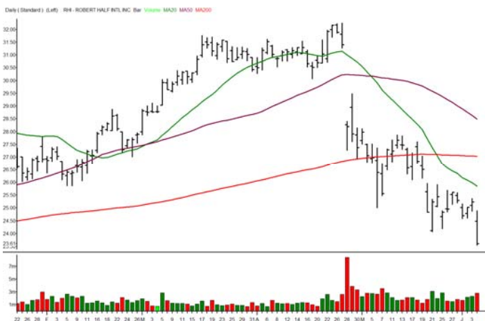
ROBERT HALF INTL INC