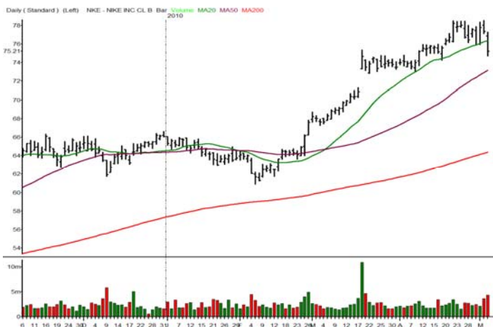
ST JUDE MED INC