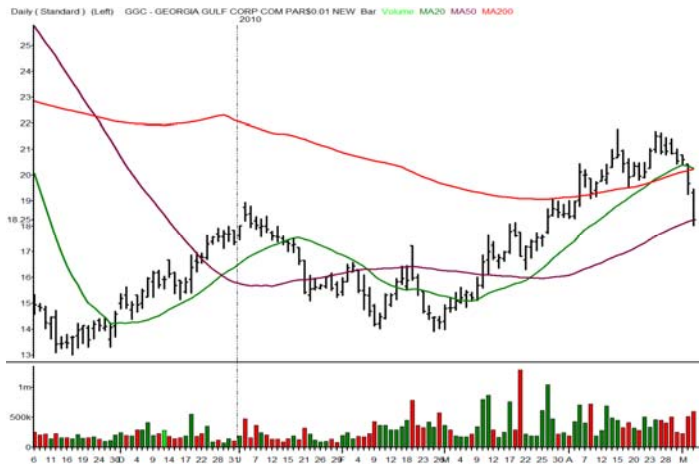
GEORGIA GULF CORP COM PAR$0.01 NEW