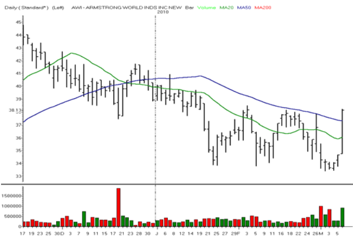
ARMSTRONG WORLD INDS INC NEW