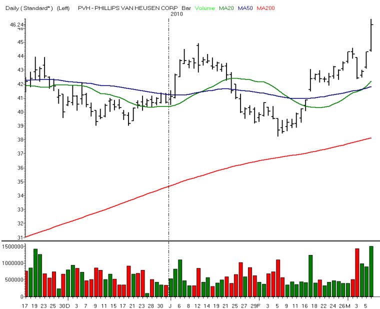
PHILLIPS VAN HEUSEN CORP