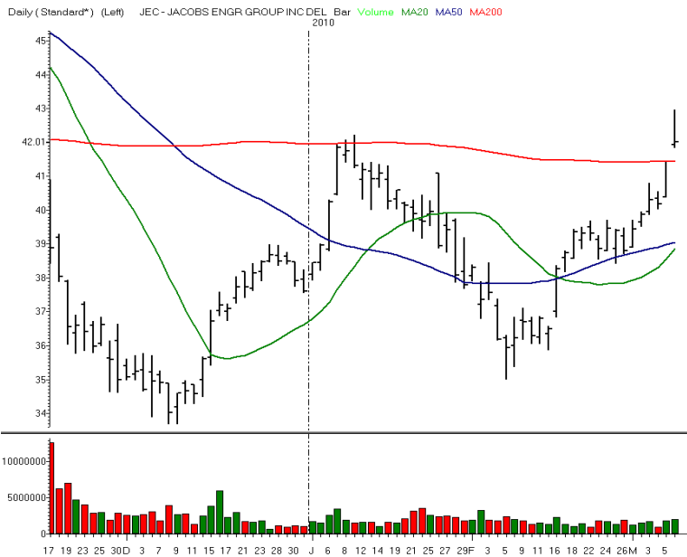
JACOBS ENGR GROUP INC DEL