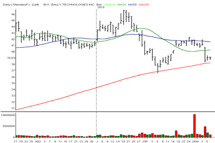
BALLY TECHNOLOGIES INC