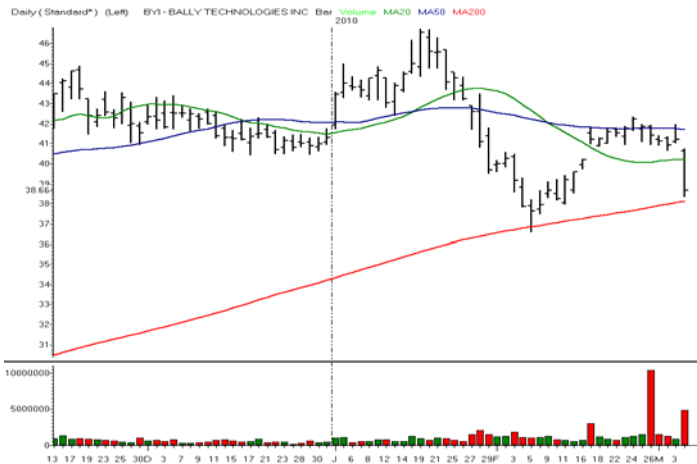
BALLY TECHNOLOGIES INC