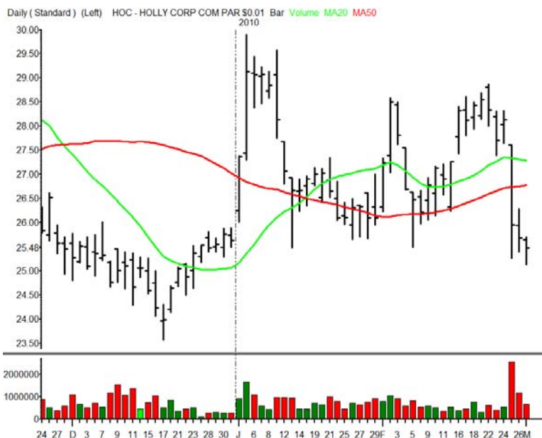
HOLLY CORP COM PAR $0.01

Symbol HOC Sector ENERGY Sector Symbol $DXE.X Pattern Backdoor Slider Position Short Entry 25.03 Target 24.76