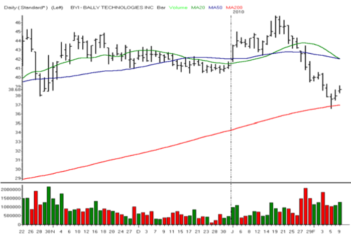
BALLY TECHNOLOGIES INC