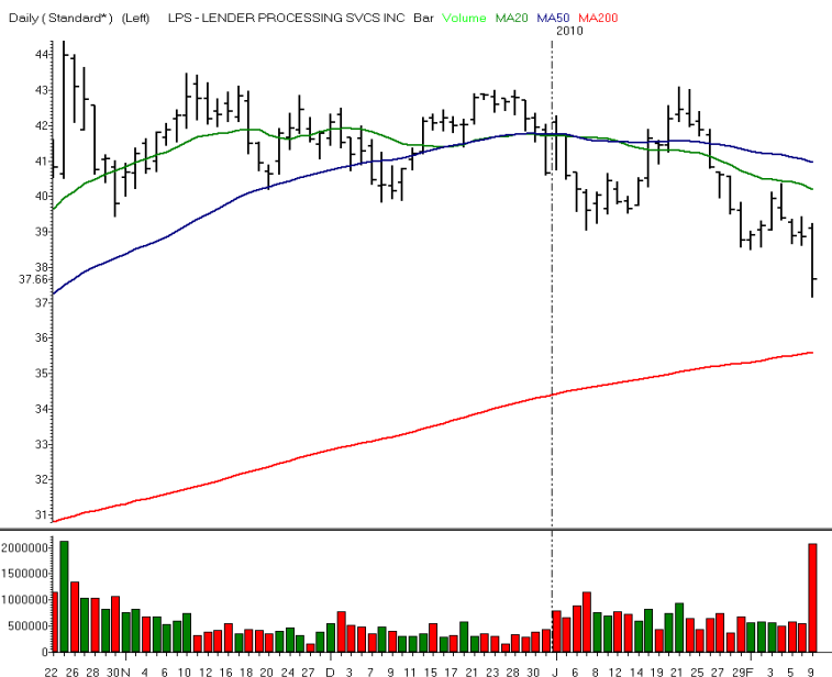
LENDER PROCESSING SVCS INC

Symbol LPS Sector INFORMATION TECHNOLOGY Sector Symbol $XIT.X Pattern Fast Ball Position Short Entry 37.06 Target 36.72