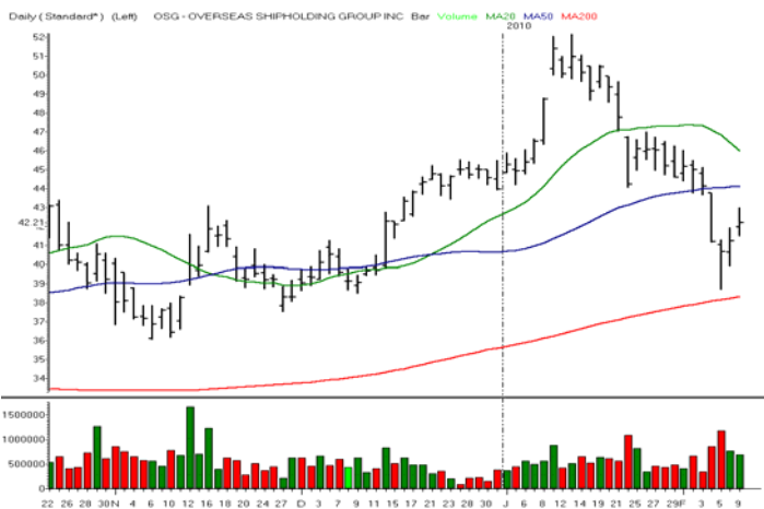
OVERSEAS SHIPHOLDING GROUP INC