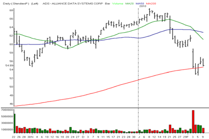
ALLIANCE DATA SYSTEMS CORP