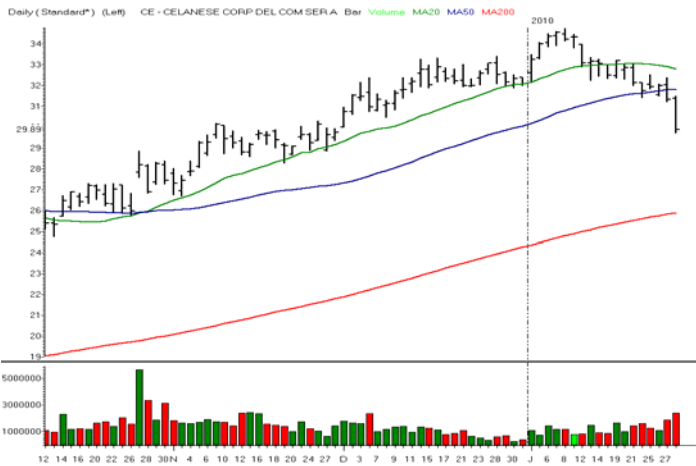
CELANESE CORP DEL COM SER A

Symbol CE Pattern Fast Ball Position Short Entry 29.63 Stop ? Initial Target 29.14