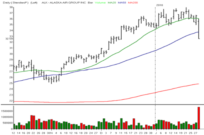
ALASKA AIR GROUP INC

Symbol ALK Pattern Fast Ball Position Short Entry 32.48 Stop ? Initial Target 31.93