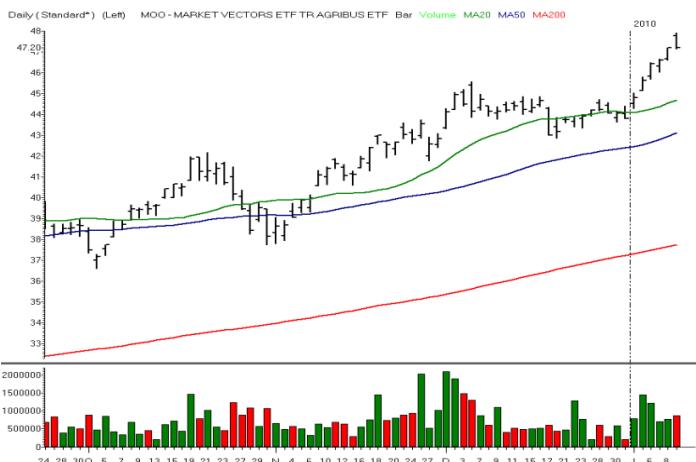
MARKET VECTORS ETF TR AGRIBUS ETF

Resistance 2 71.34 Resistance 1 70.21 Pivot 68.16 Support 1 67.03 Support 2 64.98 INDUSTRIALS 50% To Target 69.64