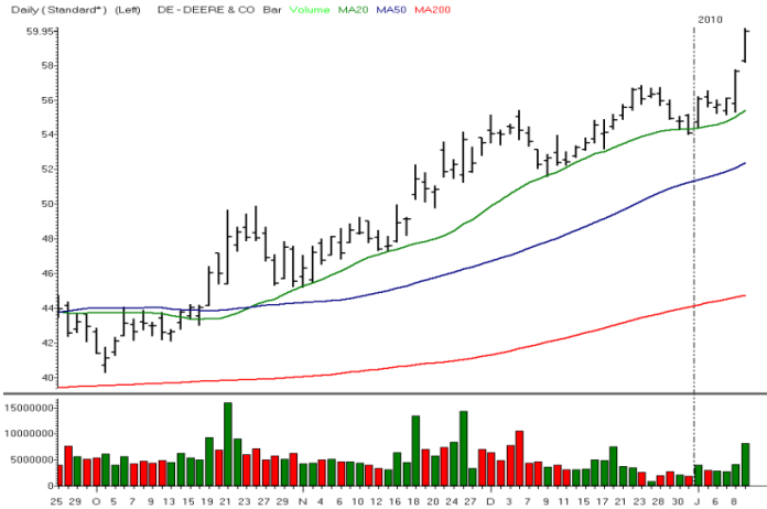
DEERE & CO

Symbol DE Pattern Line Drive Position Long Entry 60.26 Stop ? Initial Target 60.72