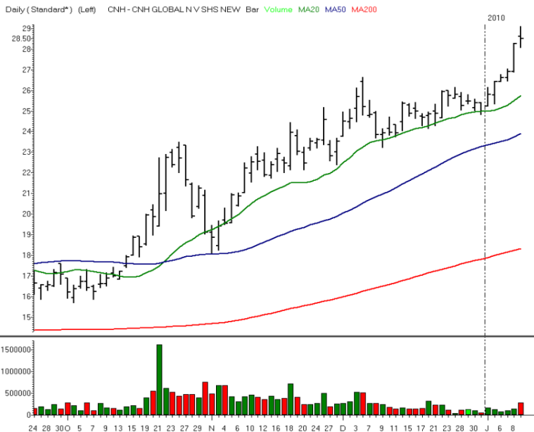
CNH GLOBAL N V SHS NEW

Symbol CNH Sector INDUSTRIALS Pattern Infield Fly Position Short Entry 27.97 Target 27.62