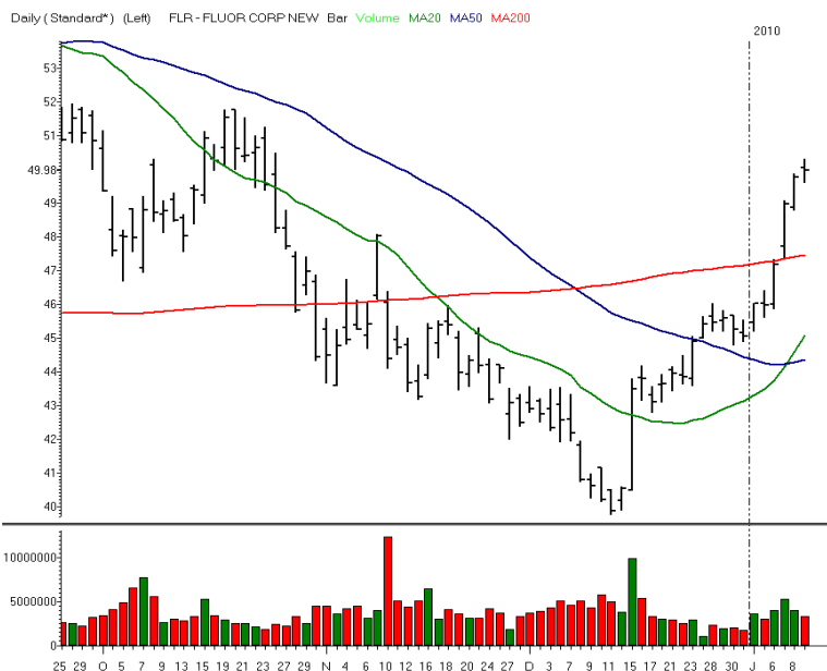
FLUOR CORP NEW

Symbol FLR Sector INDUSTRIALS Pattern Infield Fly Position Short Entry 49.52 Target 49.17