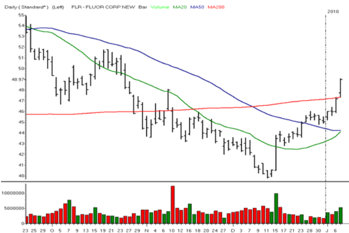
FLUOR CORP NEW

CONSUMER DISCRETIONARY 50% To Target 32.25