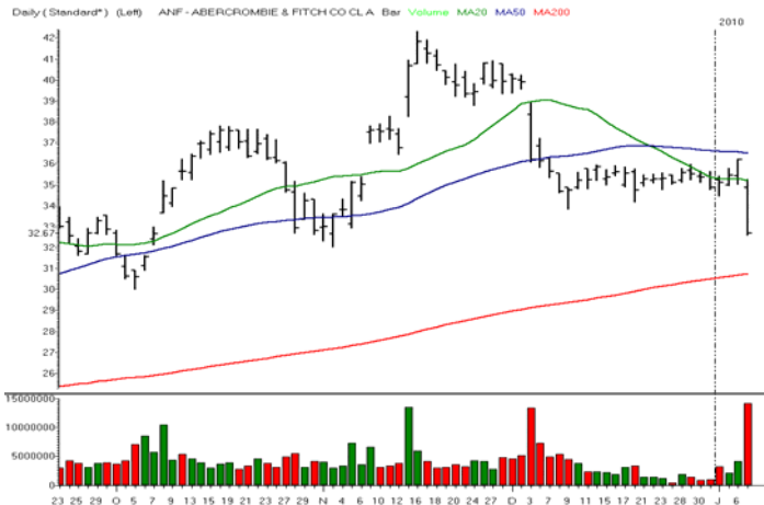
ABERCROMBIE & FITCH CO CL A

Symbol ANF Pattern Fast Ball Position Short Entry 32.49 Stop ? Initial Target 32.01