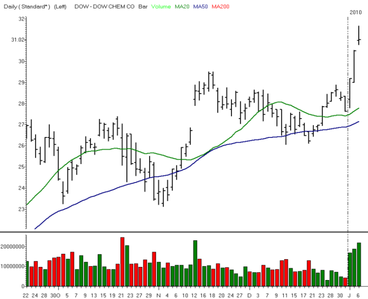
DOW CHEM CO

Symbol DOW Sector MATERIALS Pattern Infield Fly Position Short Entry 30.68 Target 30.29