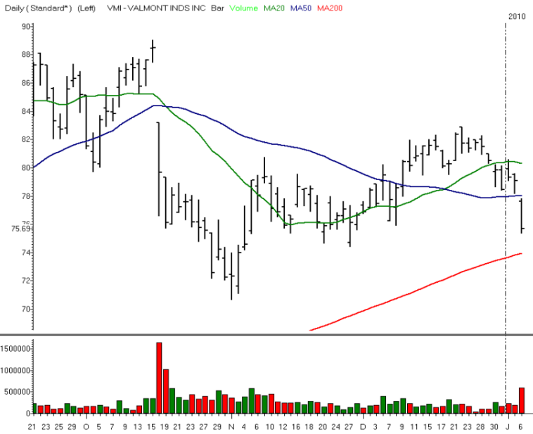
VALMONT INDS INC

Symbol VMI Sector INDUSTRIALS Pattern Fast Ball Position Short Entry 75.27 Target 74.91