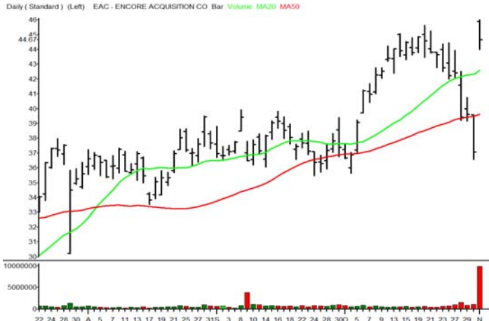
ENCORE ACQUISITION CO

Symbol EAC Pattern Infield Fly Position Short Entry 43.90 Stop ? Initial Target 43.36