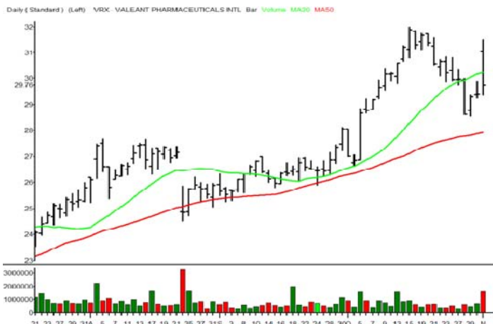
VALEANT PHARMACEUTICALS INTL

Resistance 2 19.46 Resistance 1 18.96 Pivot 18.48 Support 1 17.98 Support 2 17.50 TELECOMMUNICATION SERVICES 50% To Target 17.62