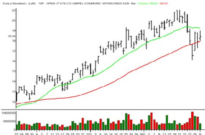
OPEN JT STK CO-VIMPEL COMMUNIC SPONSORED ADR

Resistance 2 46.89 Resistance 1 45.78 Pivot 44.89 Support 1 43.78 Support 2 42.89 ENERGY 50% To Target 43.63