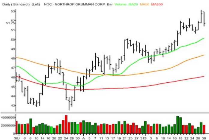
NORTHROP GRUMMAN CORP

Resistance 2 44.63 Resistance 1 43.94 Pivot 43.46 Support 1 42.77 Support 2 42.29 HEALTH CARE 50% To Target 42.69