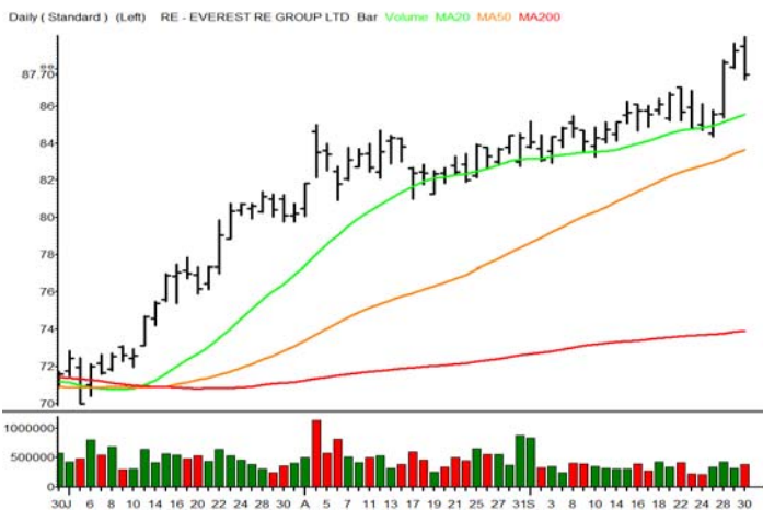
EVEREST RE GROUP LTD

Resistance 2 53.56 Resistance 1 52.65 Pivot 52.05 Support 1 51.14 Support 2 50.54 INDUSTRIALS 50% To Target 51.17